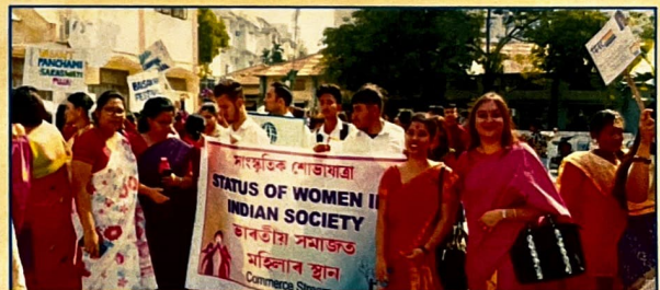
Cultural Procession winners