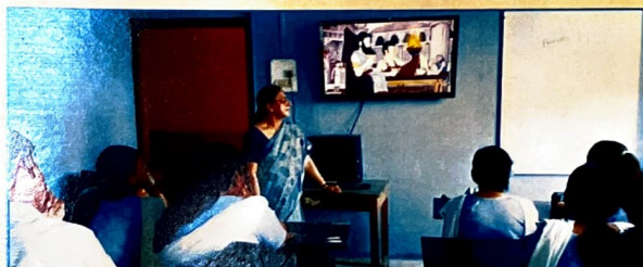
An ICT Class in Progress