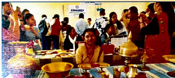
Exhibition of Students' Skills